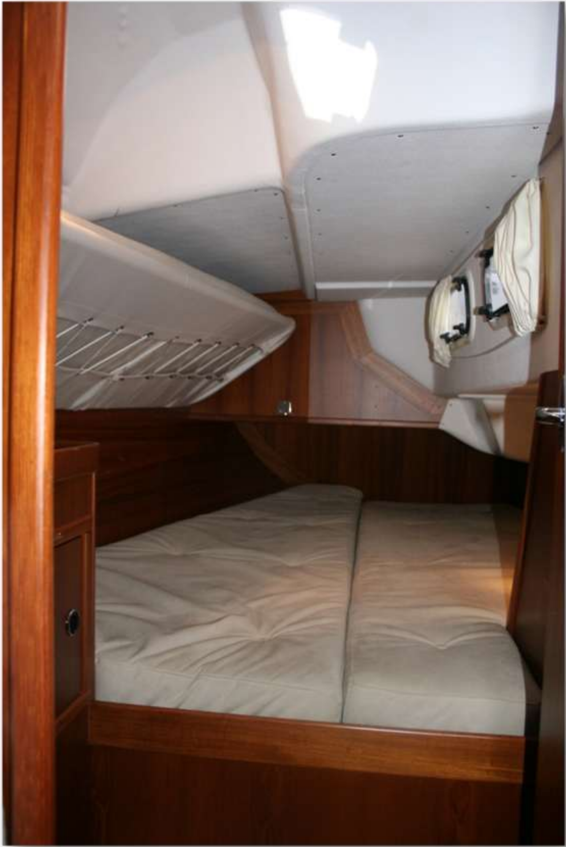
Starboard aft cabin with sea berth